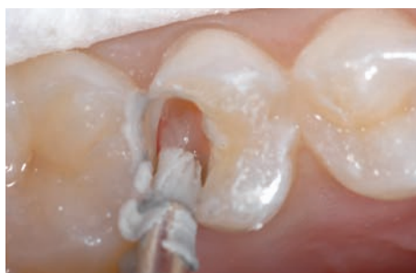
FIGURE 2 Fairly extensive decay was removed and the preparation cleaned with a wet pumice mixture on a brush, after which the preparation was washed and briefly air-dried.