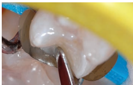
FIGURE 9 A lateral placement technique was utilized for enamel increments. The first increment was pulled toward the buccal margin, smoothed, and light polymerized. A1 Enamel shade composite was used for the enamel increments.