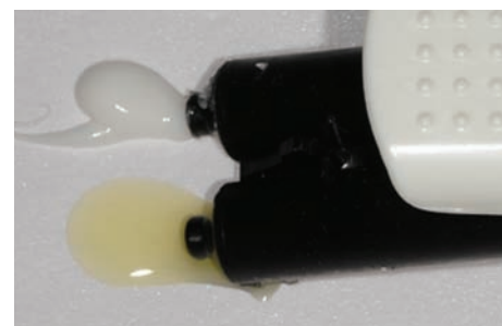
FIGURE 3 A thin layer of the RMGI liner was dispensed, mixed, and placed with an applicator, after which it was light-cured for 20 seconds. A sectional matrix, wedge, and ring were also placed.