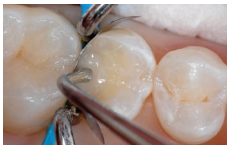
FIGURE 8 The author utilized a horizontal placement technique for the dentin increments. A2 Body shade composite was utilized for the dentin increments.