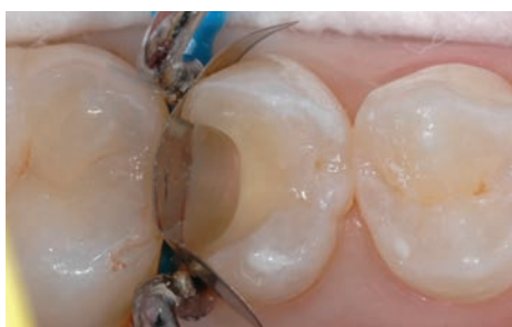
FIGURE 4 Virtually all of the exposed dentin was covered with a thin layer of the RMGI liner, and a bevel of approximately 45° was placed on the enamel margins.