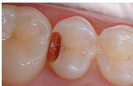
FIGURE 1 Preoperative view. The pre-existing restoration failed due to recurrent decay.