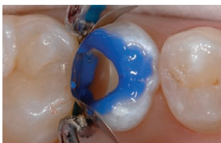
FIGURES 5 AND 6 Phosphoric acid was placed on all enamel margins for 10 seconds and then flowed into the preparation for another 10 seconds. The acid was thoroughly washed out and the preparation briefly dried. “Wet” bonding was not a significant issue because most of the dentin was already covered with the RMGI liner.