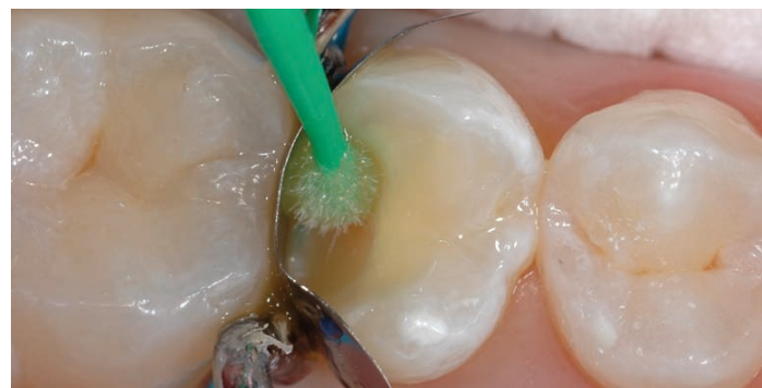
FIGURE 7 Several coats of a dentin-bonding agent were applied. It is very important to evaporate the solvent carriers prior to polymerization.