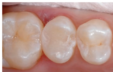
FIGURE 12 Immediate post-placement view of the case. Extra-thin finishing disks are essential for proper interproximal finishing and polishing.